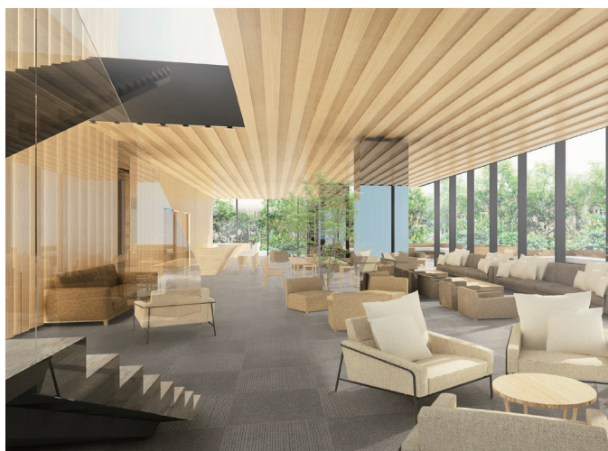
iD-8101 room image

With the sense of natural colors, the kumade collection brings calmness and coolness.