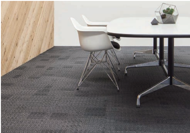
Magnetite room image