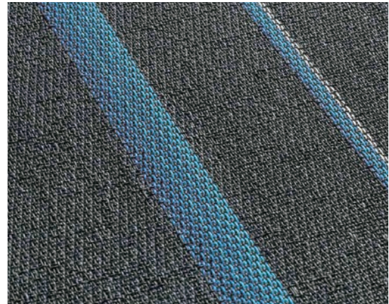
Eclipse BLUE face yarn image