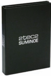
High Tech Floor 2tec2 Vinyl carpet sample book

We are delighted to announce that Suminoe Co., Ltd started the marketing of 2tec2, woven vinyl high-tech flooring, on August 1 st .