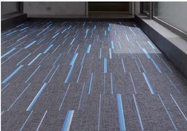
Eclipse room image